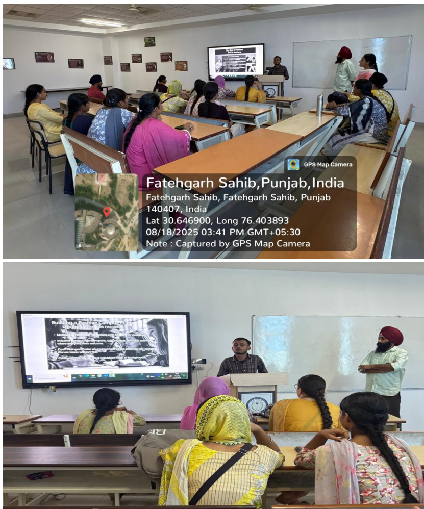
Fig.5 Students Presenting PPT on Anti-Ragging Awareness

ESTABLISHED BY PUNJAB STATE ACT 20/2008, APPROVED UNDER SECTION 2(f) OF U.G.C. ACT, 1956, NAAC Accredited