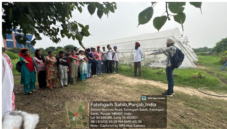
Fig.1 Students Taking Anti-Ragging Oath

ESTABLISHED BY PUNJAB STATE ACT 20/2008, APPROVED UNDER SECTION 2(f) OF U.G.C. ACT, 1956, NAAC Accredited