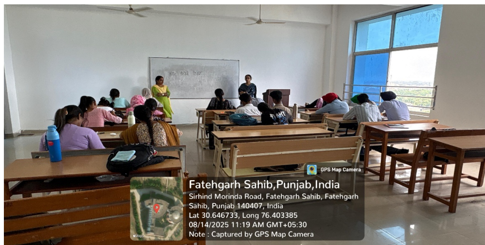
Fig.2 Students Participating in Anti-Ragging Awareness Essay Writing Competition