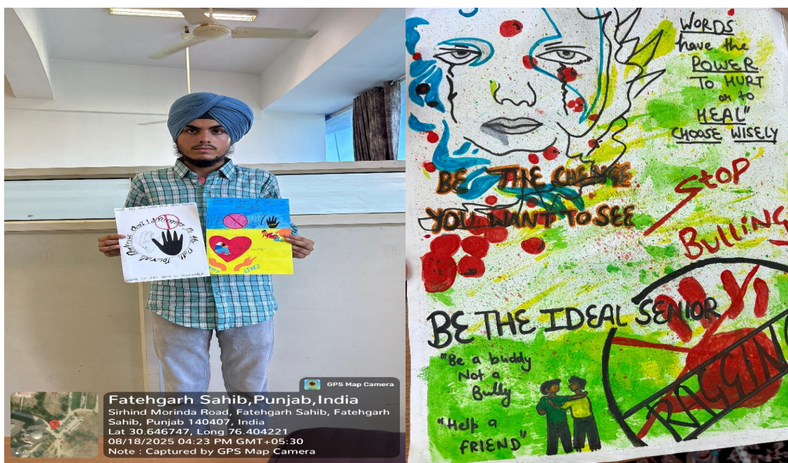
Fig.4 Students Speak Through Colours: Anti-Ragging Poster Making Competition