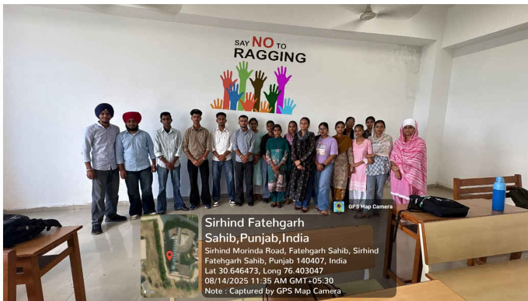
Fig.6 United for Safety: Students Promote Anti-Ragging Message

ESTABLISHED BY PUNJAB STATE ACT 20/2008, APPROVED UNDER SECTION 2(f) OF U.G.C. ACT, 1956, NAAC Accredited